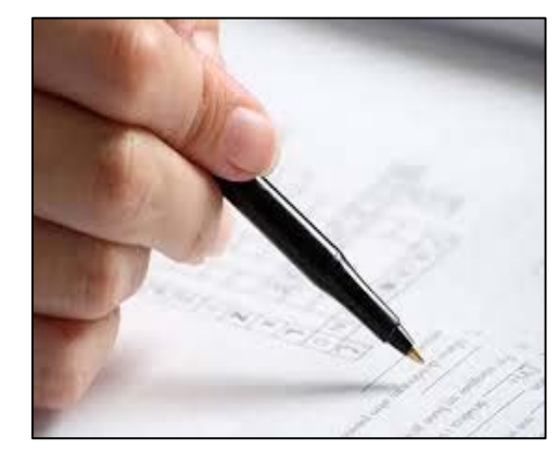
'If it isn't documented, it didn't happen...'